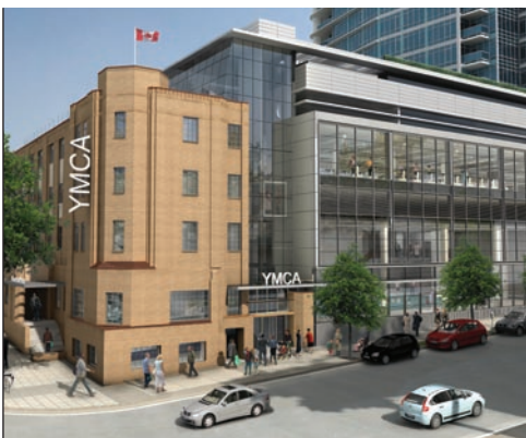
The new Robert Lee YMCA is scheduled to open in late 2009