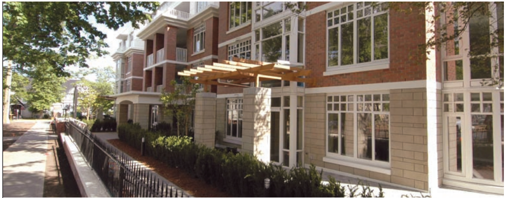
Chelsea, a 66-suite condominium building in Victoria is almost complete; a few suites remain available for purchase

Construction is progressing exceptionally well at 365 Waterfront, Concert's fourth residential development in Victoria on Vancouver Island. The concrete work on the tallest part of this terraced building is almost complete, and the concrete work on the other two terraced sections is well underway.