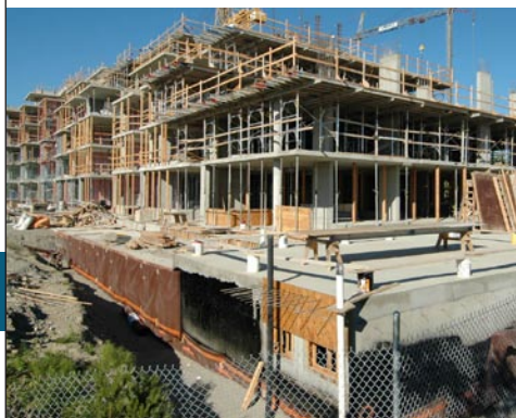
The extensive concrete work continues at 365 Waterfront; a collection of 84 homes in a contemporary, terraced six-storey lowrise condominium

For more information visit www.365Waterfront.com