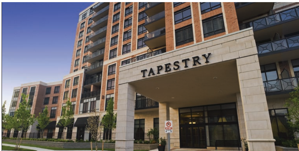
Tapestry at Village Gate West, in Toronto's neighbourhood, opened its doors on April 1, 2008

Celebrating its five-year anniversary this year, Tapestry at The O'Keefe – Arbutus Walk has enjoyed tremendous success, thanks to its outstanding residents and dedicated staff, who will continue in their roles and pursuit of excellence.