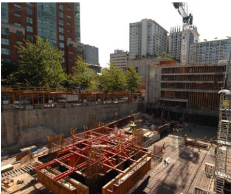
Construction of the parkade for Patina and the Robert Lee YMCA continues

For more information visit www.DiscoverPatina.com