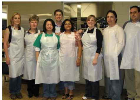
Concert's Toronto team dons aprons to lend a hand