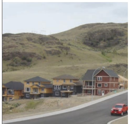
Saddleback Hills is a project co-owned by Concert and the Operating Engineers Pension Plan; Concert is also the Project Manager

For more information visit www.SaddlebackHills.com