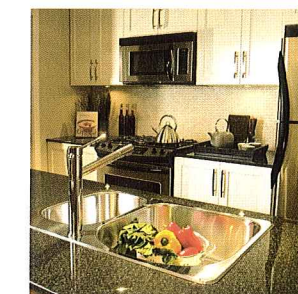
A private club, fitness studio and garden terrace are among the features included in Emporio, close to transportation in the heart of Richmond.

Homes at Emporio will be available for purchase later this month. For more information and an opportunity to visit the Emporio presentation centre prior to the public opening, visit www.EmporioRichmond.com .