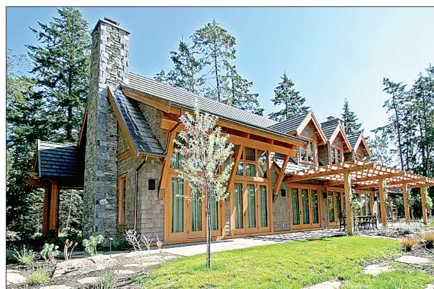
The People's Choice Award went to the Stamp residence on Saltspring Island, built by Wilco Construction. The home's design reflects the Vancouver owner's desire to create in Canada a bit of the Cotswold-style architecture he grew up with in England.